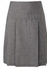
Plain dark grey knee-length school skirt for girls