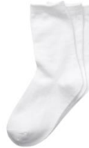
Plain white socks