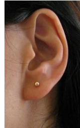
Small pair of stud earrings for girls