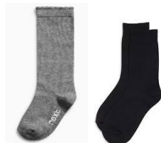
Plain black or grey socks