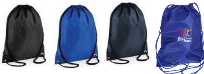
Plain royal blue, navy blue, or black drawstring PE bag, or a Reach Academy drawstring PE bag