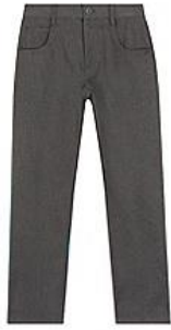
Plain dark grey school trousers

The rest of the uniform does not need to be Reach Academy branded and can be bought in any shop. The following items are permitted: