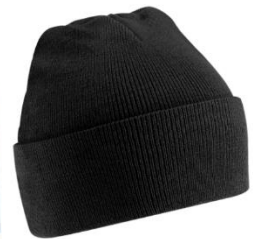
Plain black or blue hat, or Reach Academy hat