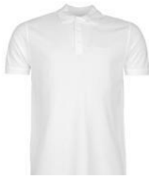
Reception to Year 2: plain white polo shirt