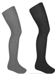
Plain black or grey tights for girls