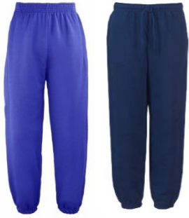
Plain royal or navy blue tracksuit trousers

For PE, the following items are permitted: