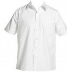
Years 3 – 6: plain white short-sleeved or long-sleeved shirt or blouse