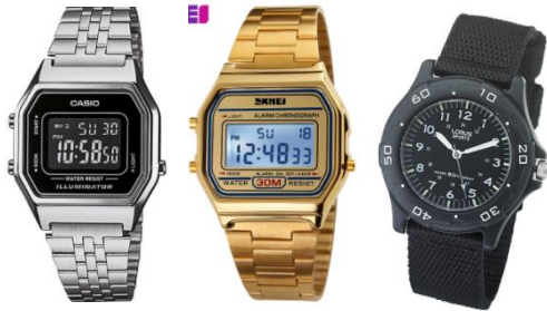
Plain silver, gold, or black watch