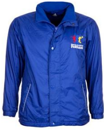
Reach Academy jacket

For outdoor clothing, the following items are permitted: