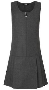
Plain dark grey knee-length school dress for girls