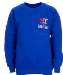
A Reach Academy PE sweatshirt