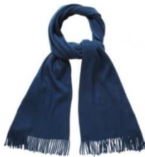
Plain black or blue scarf