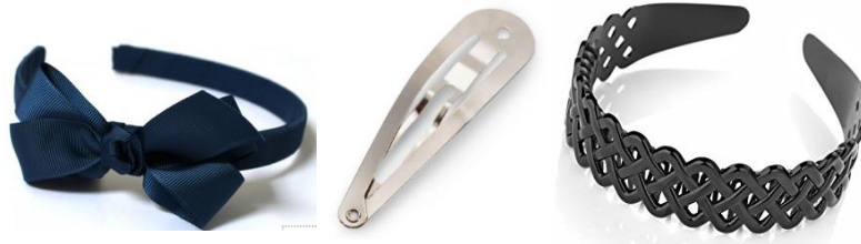
Plain black, navy blue, or silver hair clips and hair bands

Pupils must look neat and tidy. The school reserves the right to decide what neat and tidy looks like.