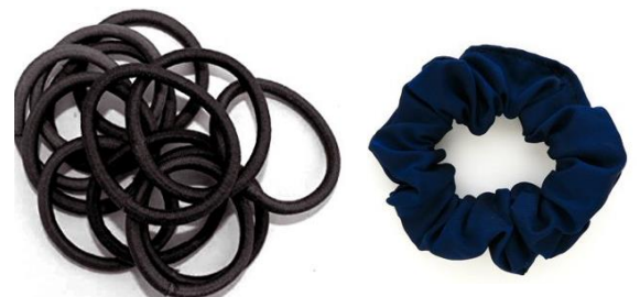
Plain black or navy blue hair ties