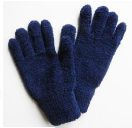
Plain black or blue gloves