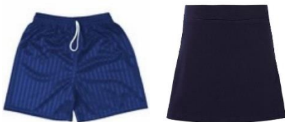
Plain blue shorts, or plain blue skort for girls