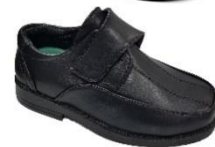
Plain, smart, black school shoes