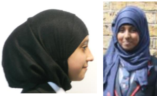
Plain black or navy blue headscarf