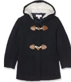
Plain black or blue jacket or coat