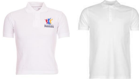
Plain white or Reach Academy polo shirt