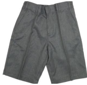
Plain dark grey school shorts for