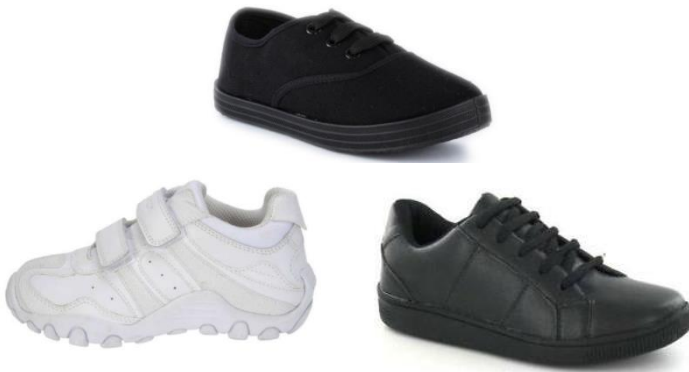
Plain black or white trainers, or plain black plimsolls